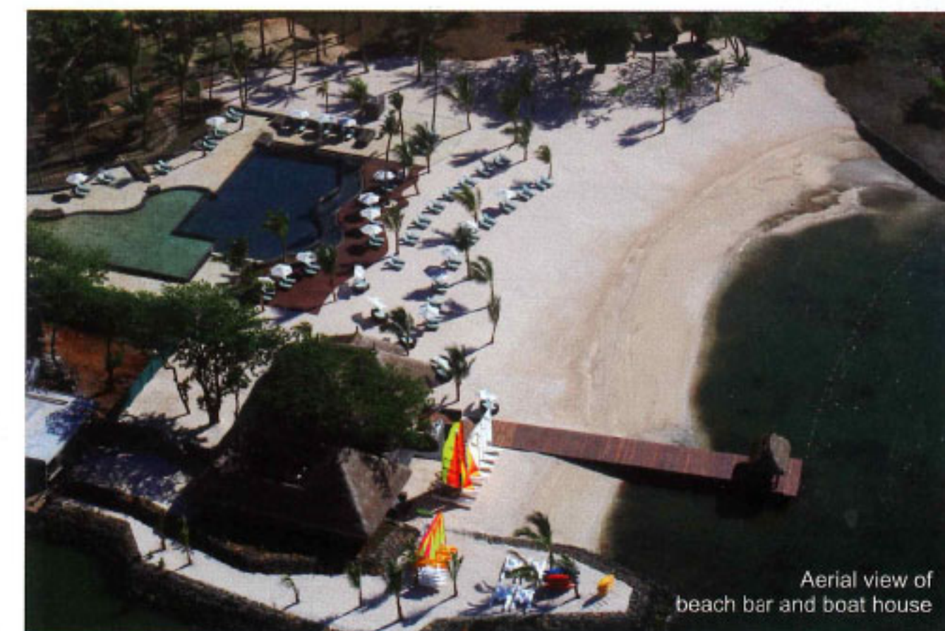
Aerial view of beach bar and boat house