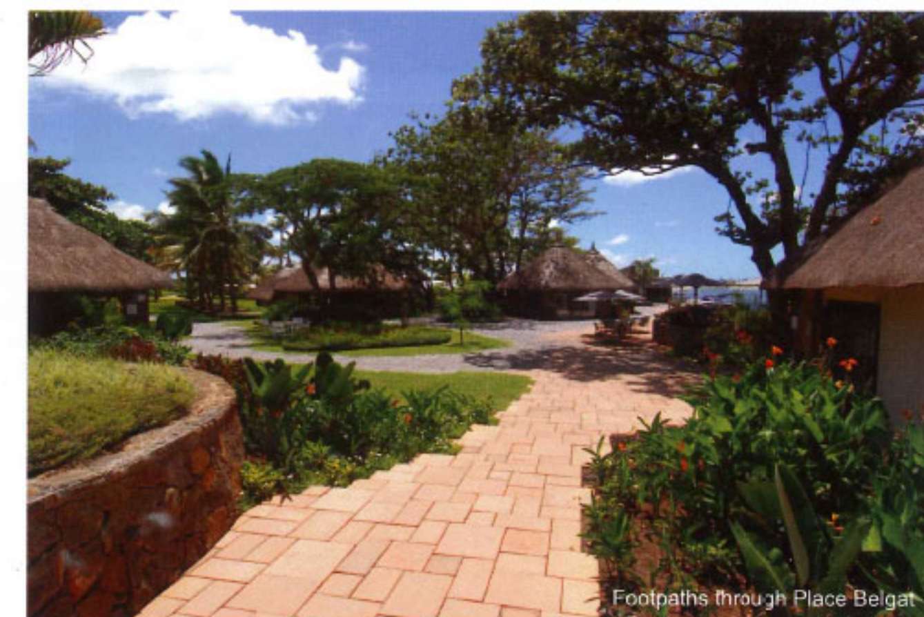
Footpaths through Place Belgat