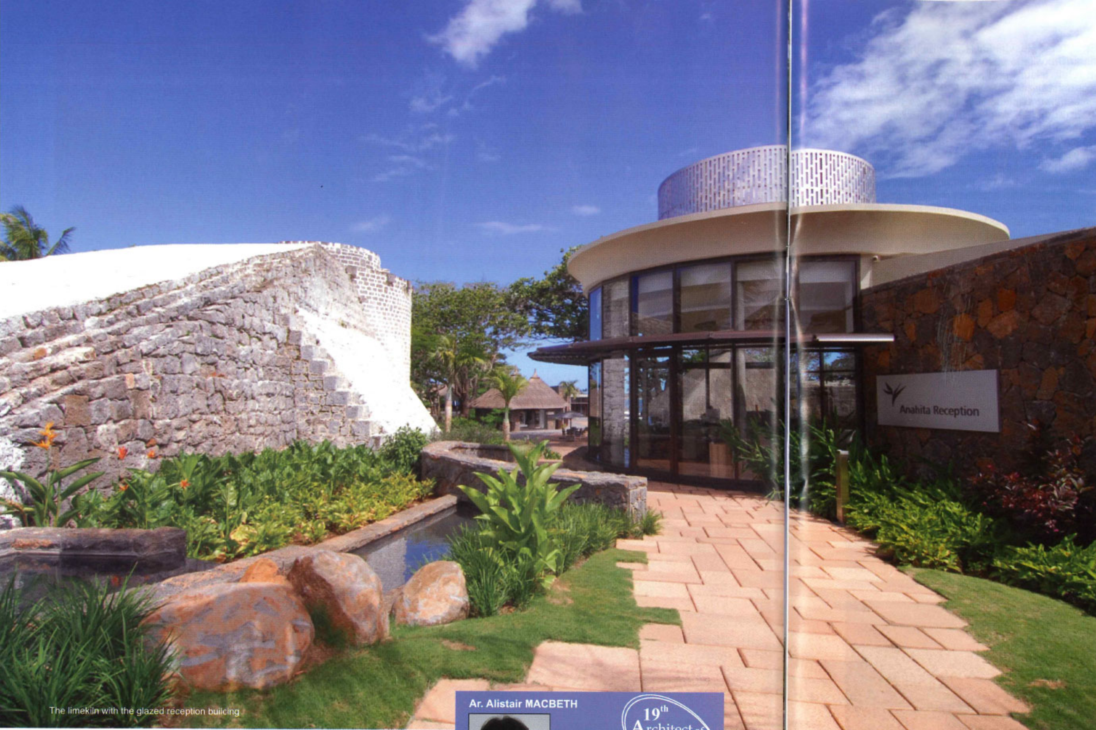
The limekiln with the glazed reception building